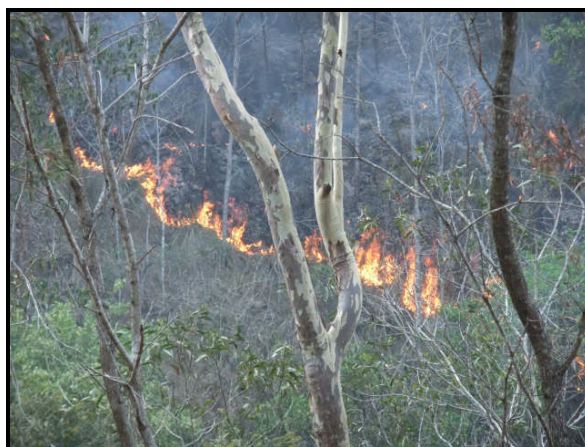
Mosaic burning and fuel reduction

In St. Francis' Canticle of the Sun, he writes of Brother Fire as being mighty and strong . Anyone living in the Australian bush soon learns just how mighty and strong Brother Fire can be. Ever since we were very nearly completely burnt out in the early nineties, we have put a lot of effort into our bushfire protection strategy. This area has recently been identified as one of the most potentially dangerous areas of New South Wales for bushfires. There are four categories, the fourth is the most dangerous and that is us.